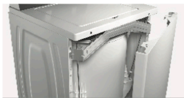
REMOVABLE FRONT PANEL