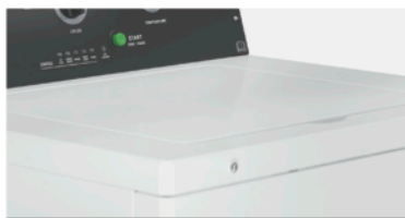
PREMIUM PORCELAIN ENAMEL TOP & LID