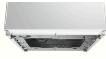
EASY-ACCESS STEEL BASE